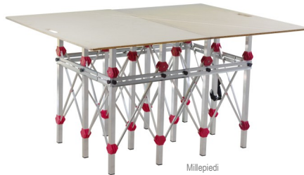
Millepiedi + Side Telescopic Fixings kit + "any spare wood board"